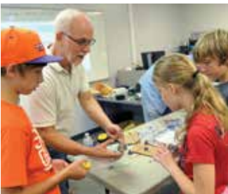
Light and Laser Summer Camp ..... 15