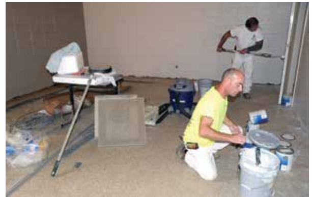
Renovations to Halbert Hall continue with upgrades to the surgical suite and the new student lounge.

Know that every single donor gift supports critical needs of this program. Make a gift of any amount at TCTC http://www.tctc.edu/Foundation/Give .