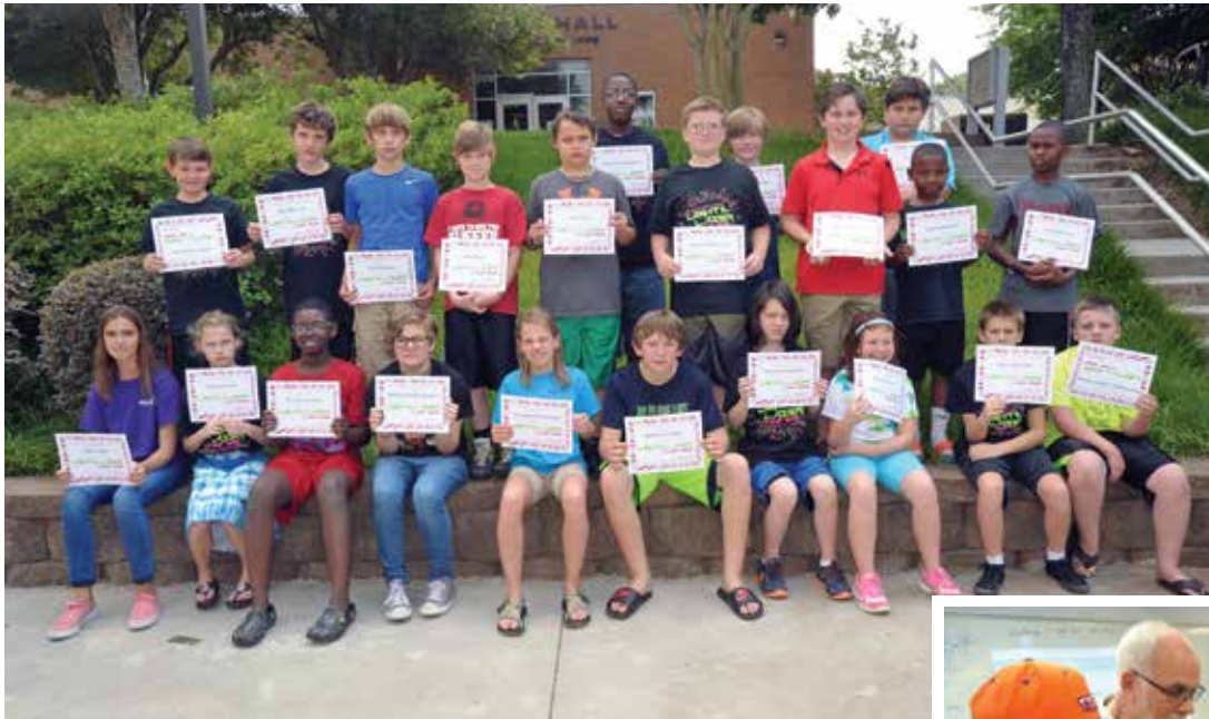
COUNTERCLOCKWISE FROM TOP LEFT:

The Engineering and Industrial Technology Division hosted this annual summer camp with funding provided by Robert Bosch LLC and Laser Tec.