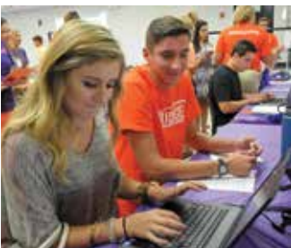
800 Accepted into Bridge To Clemson This Fall ..... 19