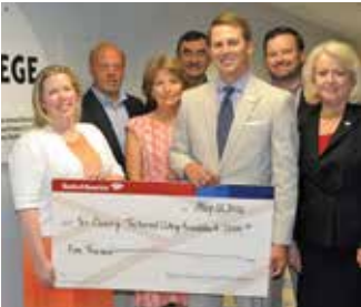
Companies Support C2C Program ..... 7