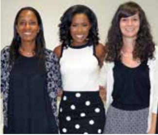
Miss SC 2015 Addresses Upward Bound Students ..... 4