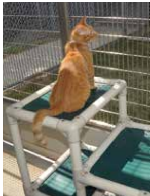
The orange tabby enjoys the sun room.