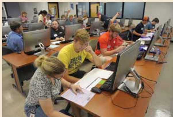
Bridge students talk with advisors while finalizing their class schedules.